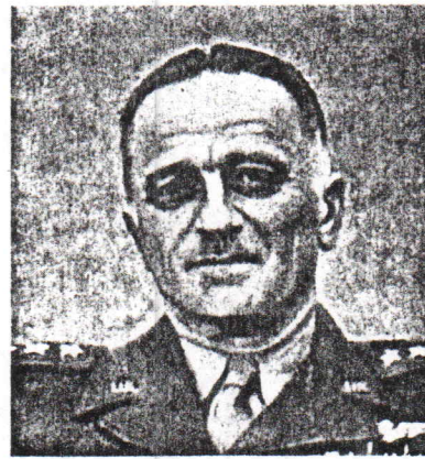
GEN. CARL SPAATZ

WITHIN two years of West Point and his 2d lieutenant's commission in the Infantry, Carl Spaatz learned to fly at the San Diego school of the Signal Corps and was serving in the 1st Aero Squadron on the Mexican border. The next year, 1917, he was overseas with the AEF, a training officer at the famed Air Service School at Issoudun. Later, in 1918, he was a pursuit pilot in the 2d Pursuit Group, and was credited with downing three Fokkers.